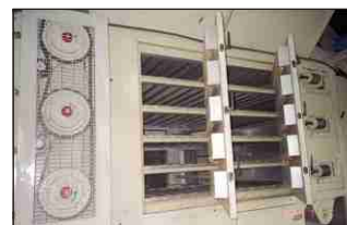
Drive & Tray Circuits